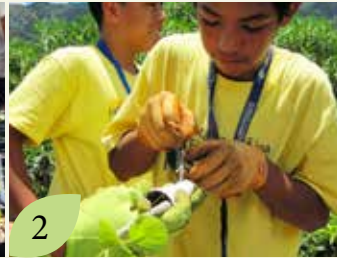
2 Collection of seeds and cuttings of appropriate native Hawaiian trees and shrubs from nearby areas to be used for propagation (hundreds of seedlings have already been started).