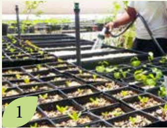
1 Construction of on-site plant propagation facilities (e.g., propagation lab, shade-house and outdoor nursery) at Pālehua.