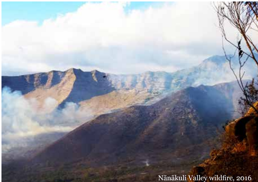
Nānākuli Valley wildfire, 2016

The goal is to heal the land, ocean, and multitude of life through engagement and education.