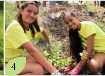
4 Coordination of students, volunteers, and interns to provide hands-on support to propagate, plant, maintain, and study regeneration sites, as well as educate local and out of state visitors.