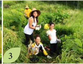
3 Preparation of six intensively planted regeneration test sites, each approximately one acre in size, from mauka to makai with fencing to protect plants from grazing and invasive animals like (as needed) and innovative irrigation systems.